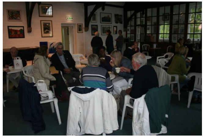
A corner of the room with people enjoying their Cream teas in Hadleigh

PS: During quieter times two of us went and supported our neighbour's dress shop!