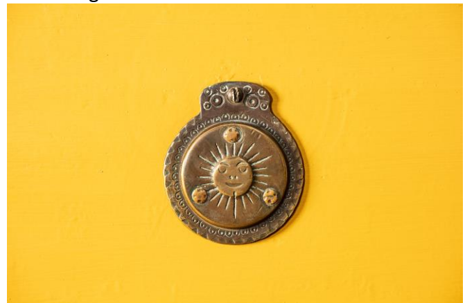
Spyhole in the side door: photo Historic England: Patricia Payne